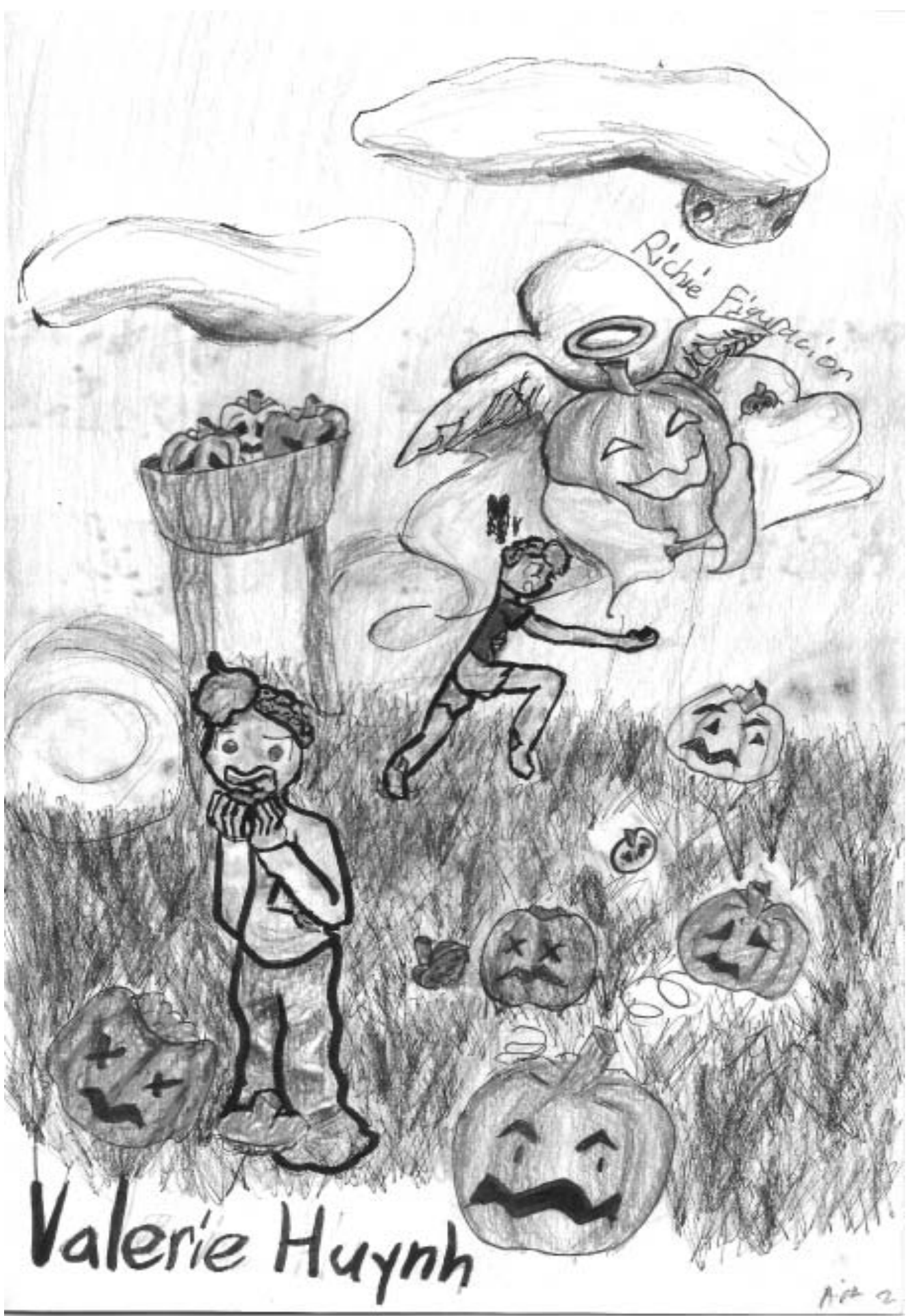
Valerie Huynh '22 and Richie Figuracion '21